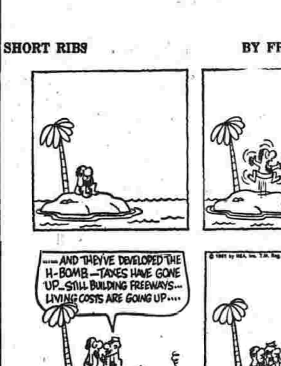
BY FRANK O'NEAL