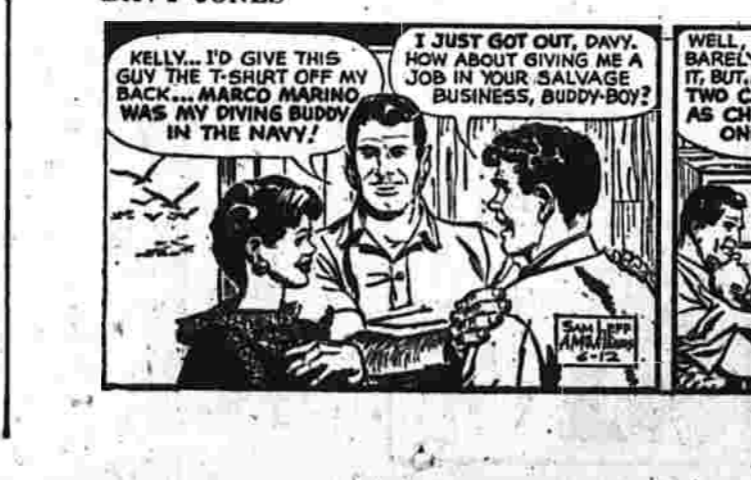
BY LEFF and McWILLIAMS