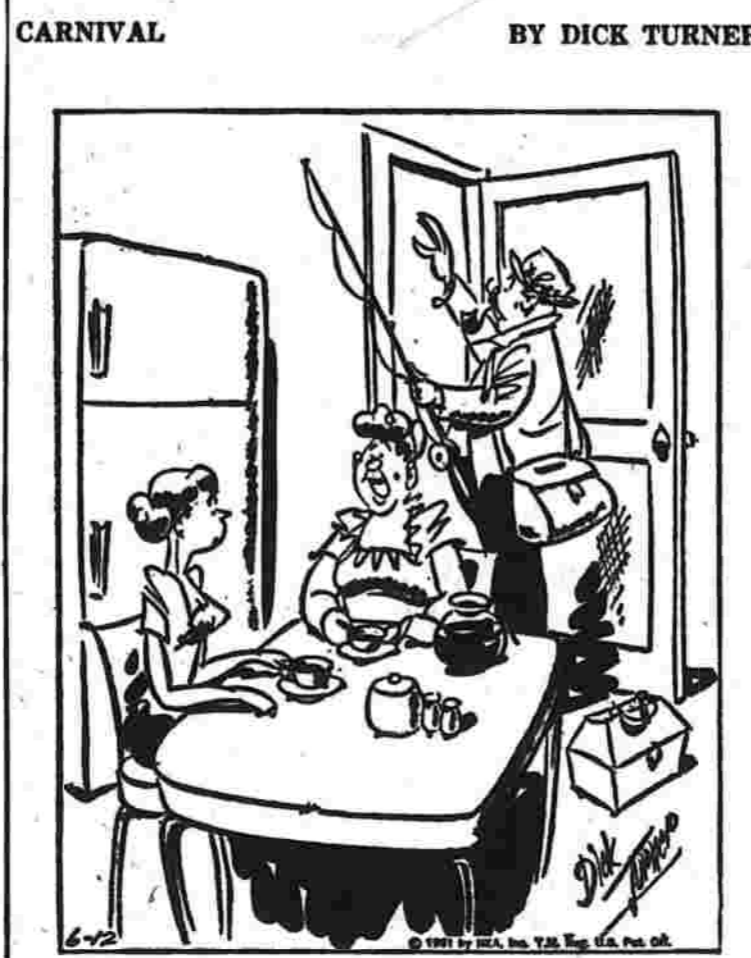
BY DICK TURNER