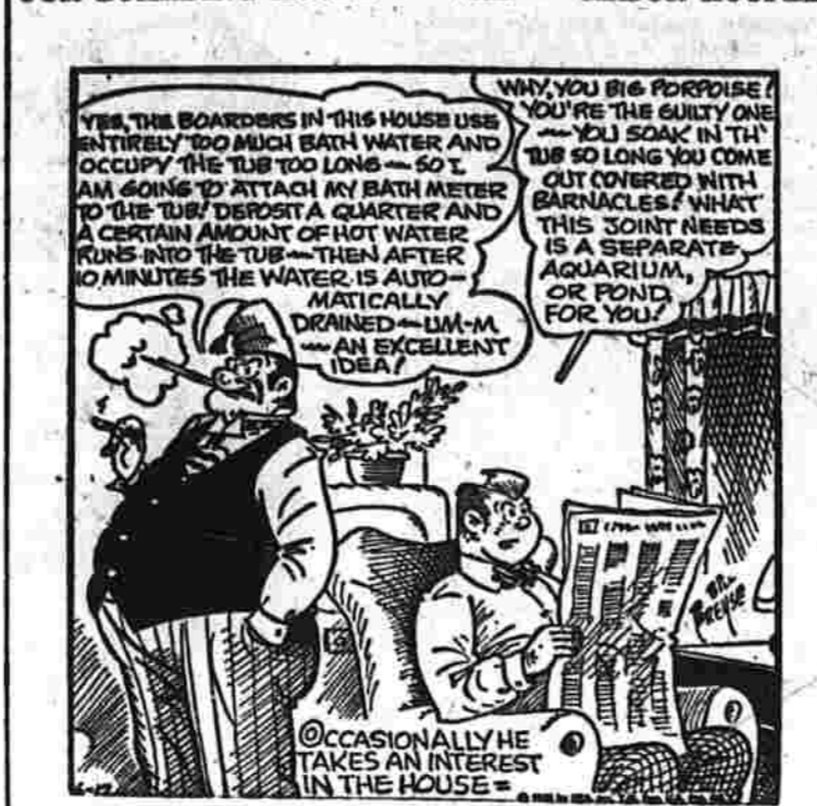
BY DICK TURNER