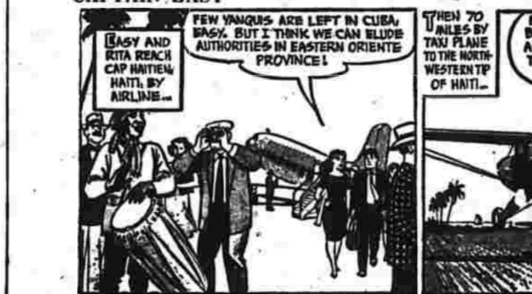
BY LESLIE TURNER