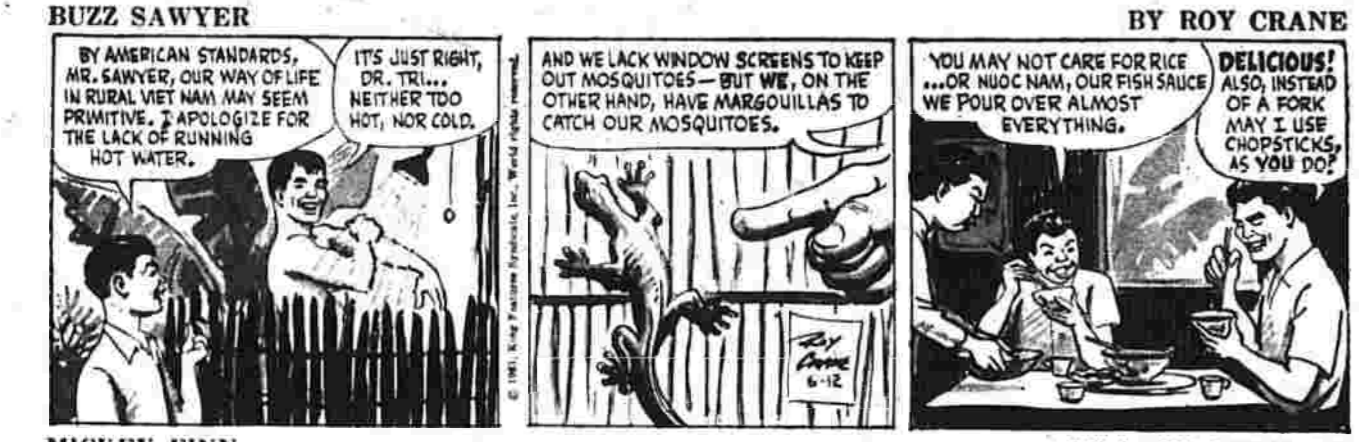
BY ROY CRANE