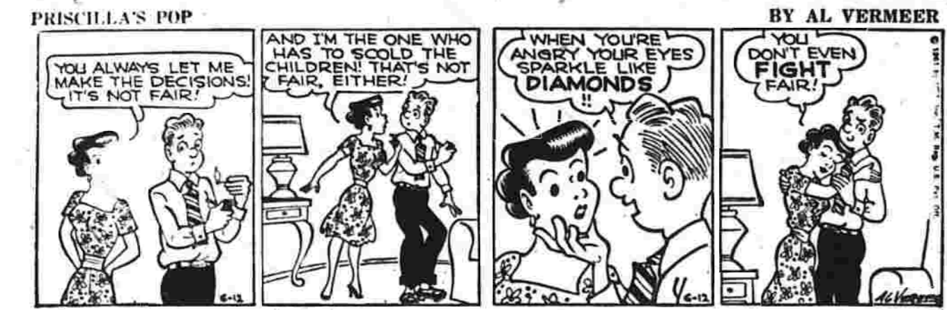
BY AL VERMEER