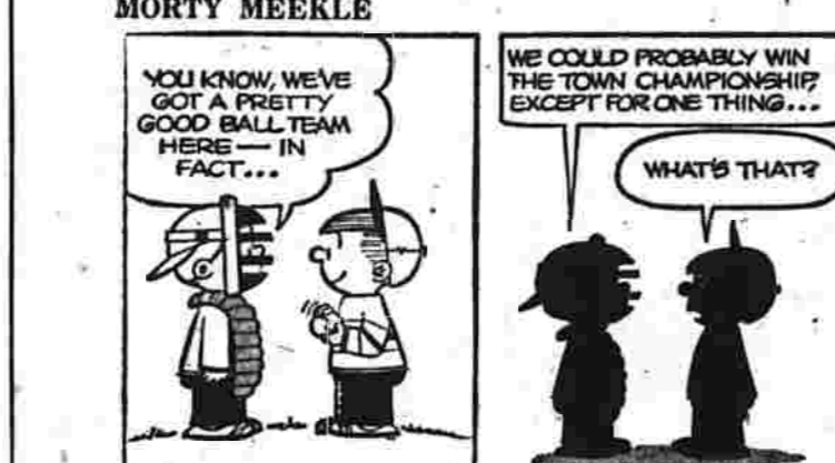
BY DICK CAVALLI