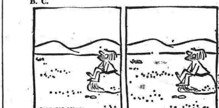
BY JOHNNY HART