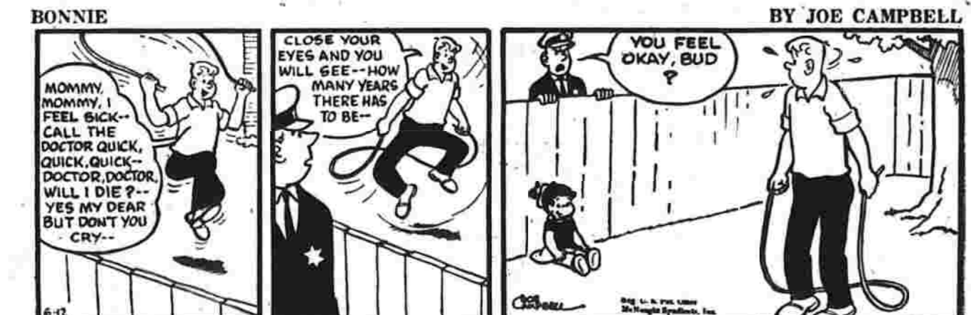
BY JOE CAMPBELL