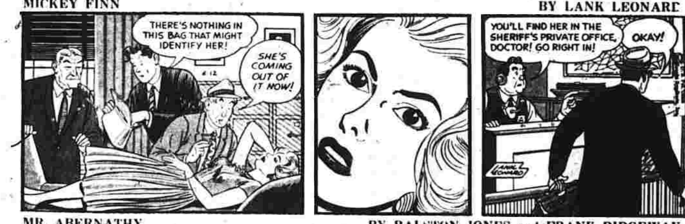
BY LANK LEONARD